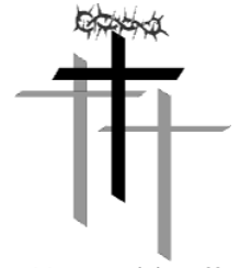
He would suffer on the cross!