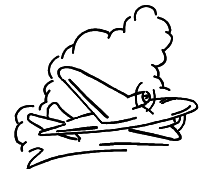
Going back in a time machine

I magine yourself boarding an aircraft and travelling, not only to another country, but back in time! Eventually you land in Jerusalem as it was almost 2,000 years ago. When you get off the plane you discover that everyone is talking about a holy teacher named Jesus 1 , from a town called Nazareth. Some people like Him, while others hate Him. Some say that He is a troublemaker and deceiver, and others that He is a special messenger of God, a prophet. And there are yet others who believe He is more than a prophet, that He is the Christ.