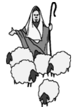
An eastern shepherd