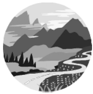
Laws of happiness

Now look at other aspects of His teaching.