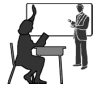
A good teacher

D o you remember the teachers you had at school? Some were good – and you learnt a lot from them. Jesus was a very good teacher. 3 He often used parables in His teaching. Parables are interesting stories with a hidden meaning.