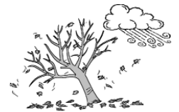
is like a forceful wind