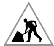
Signs have a meaning

God called the Messiah His Son, through the mouth of the Angel Gabriel, when His birth was announced, see Luke 1:26-35. The precise identity of the Messiah will become clear as you study further. The idea that God had sexual relations in order for Jesus to be born, is not found in the Bible and is repulsive to Christians.