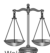
Weighing the evidence

C ourts of law are meant to weigh evidence carefully in order to discover the truth. In a similar way, the New Testament writers want us to weigh the evidence about Jesus – and this is what this course is seeking to do. You are the jury, and the disciples of Jesus (the apostles) are the witnesses. Look up Acts 2:32