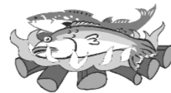
Breakfast with Jesus

S ome people say that the disciples were honest and sincere men who simply imagined they saw Jesus. In other words, they were fooled into thinking that He had come alive. But there are serious reasons why this is far from likely. Consider the following: