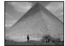
A monument to past events

Historic Note Rich men were buried in a cave-like tomb with a stone in front. Jesus "borrowed" a rich man's tomb.