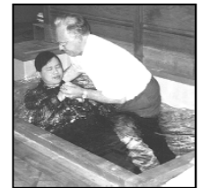
A modern day baptism

BAPTISM SYMBOLISED THE WASHING AWAY OF SIN 13