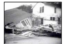
The story of two houses!

Jesus told a parable about two houses to explain the folly of not acting on His words. One of these houses was built on earth, and the other on rock. When storms and floods threatened the stability of both houses the one on