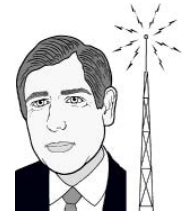
Hearing and responding

Jesus said, "What do you think about the Christ?" 1 In this course we have been finding out about Christ. What do you think about Him, and how are you going to respond? Jesus wanted people to respond by acting on the things He said. He told them to use their ears and not be indifferent, as if deaf.