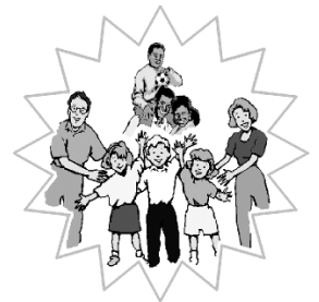
God's own family

S o how did those early believers in Christ respond to the Gospel? They responded by being baptised and joining the church. About 3,000 "were added" in one day! It was only natural that they should join, as they now belonged to the same family – the family of God. They were soon to gain strength from the warm friendship of other believers.