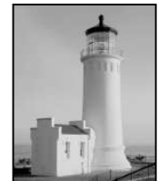
Jesus was a great light

God never made people hate Jesus, but He used the hate that was in man to bring about His purposes. The perfect life of Jesus made the imperfections of others more obvious. So they hated Jesus, and preferred to kill Him rather than have their own sinful ways exposed by His light. Jesus was a light in a dark world. Men tried to extinguish the light, preferring the darkness of their sin. Write out John 3:19