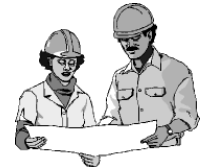
Working to a plan

The New Testament writers tell us that the death of Jesus was not some dreadful mistake, but part of God's plan and purpose. God was using the wickedness of men to provide a way of forgiveness for those who would turn from sin. Amazingly, those who crucified Jesus would find that forgiveness was available to them too! Their dreadful crime made a way by which even their sin could be forgiven! Later in this study we shall see how the death of Jesus makes forgiveness possible.