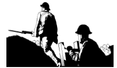
Hostility towards God

T he teaching of the New Testament is clear – sin angers a holy God, so that man is now God’s enemy. But Jesus died in the place of believers in order to reconcile them to God. 5 They are no longer God’s enemy because their sin has been punished in Christ and removed.