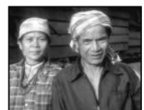
Heaven is multi-racial

B elievers from every land will be in Heaven. The New Testament describes Heaven as a holy place where God and His angels live. Nothing impure or sinful can ever enter it. 7 Believers are reconciled to God through Christ’s death, and their sin has been taken away. Now there is nothing to prevent them entering Heaven when they die.