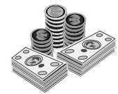
The price of a ransom!

It cost Jesus a great deal to reconcile believers to God. Jesus told us that His death was a “ransom for many”. 6 A ransom is a sum of money that is paid to buy someone back. Kidnappers often demand a ransom. Jesus gave His life in place of sinners as a ransom to redeem believers back to God. Believers are no longer their own since they are bought by Jesus, and must now live for Him. Write out 1 Peter 1:18-19