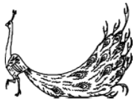
As proud as peacocks