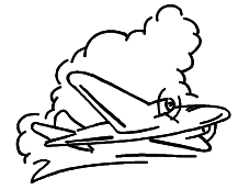
Going back in a time machine

I magine yourself boarding an aircraft and travelling, not only to another country, but back in time! Eventually you land in Israel as it was almost 2,000 years ago. When you get off the plane you discover that everyone is talking about a man named Jesus, from a town called Nazareth. Some people like Him, while others hate Him. Some say that He is a troublemaker and deceiver, 1 and others that He is a special messenger of God, a prophet. And there are yet others who believe He is the Son of God, the Christ.