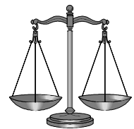
Weighing the evidence

C ourts of law are meant to weigh evidence carefully in order to discover the truth. In a similar way, the New Testament writers want us to weigh the evidence about Jesus – and this is what this course is seeking to do. You are the jury, and the disciples of Jesus (the apostles) are the witnesses. Look up Acts 2:32