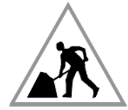
Signs have a meaning

E verywhere around us are signs – and they all have a meaning of some kind. The sign on your right tells drivers to take care, as men are working on the roads. The miracles Jesus did were signs, and they too have a meaning. The Gospels of Matthew, Mark, Luke and John record many of the miraculous signs Jesus did. Most of His miracles were compassionate. He healed those who had diseases, and made the lame to walk and the blind to see. 5 He even raised the dead.