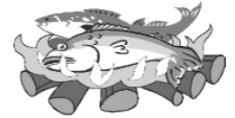
Breakfast with Jesus

S ome people say that the disciples were honest and sincere men who simply imagined they saw Jesus. In other words, they were fooled into thinking that He had come alive. But there are serious reasons why this is far from likely. Consider the following: