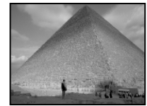
A monument to past events

H istory happened – and many ancient monuments, like the Egyptian pyramids, remain to prove it. They bear witness to events that took place hundreds of years ago. The resurrection of Jesus also happened, but nothing was left behind because the tomb was empty! Instead, we have something far more convincing – the written record of those who saw Him alive after His death.