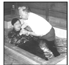
A modern day baptism