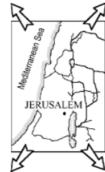
"Go into all the world!"

The New Testament tells us that Jesus was finally received back to Heaven in a cloud 3 and enthroned at God's right hand. 4