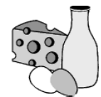
Food to grow

Peter and the other apostles instructed these early Christians in God's Word. The New Testament contains the writings of these men. You should read them daily and hear them explained to you. By doing this you will receive the food you need to grow into a strong Christian.