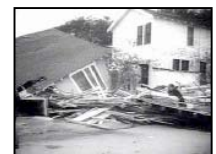
The story of two houses!

Jesus told a parable about two houses to explain the folly of not acting on His words. One of these houses was built on earth, and the other on rock. When storms and floods threatened the stability of both houses the one on