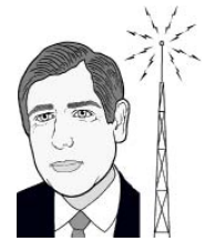
Hearing and responding

Jesus said, “What do you think about the Christ?” 1 In this course we have been finding out about Christ. What do you think about Him, and how are you going to respond? Jesus wanted people to respond by acting on the things He said. He told them to use their ears and not be indifferent, as if deaf.