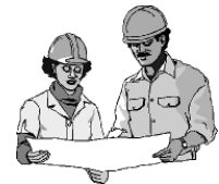
Working to a plan

T he New Testament writers tell us that the death of Jesus was not some dreadful mistake, but part of God's plan and purpose. God was using the wickedness of men to provide a way of forgiveness for those who would turn from sin. Amazingly, those who crucified Jesus would find that forgiveness was available to them too! Their dreadful crime made a way by which even their sin could be forgiven! Later in this study we shall see how the death of Jesus makes forgiveness possible.