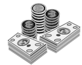
The price of a ransom!

It cost Jesus a great deal to reconcile believers to God. Jesus told us that His death was a “ransom for many”. 6 A ransom is a sum of money that is paid to buy someone back. Kidnappers often demand a ransom. Jesus gave His life in place of sinners as a ransom to redeem believers back to God. Believers are no longer their own since they are bought by Jesus, and must now live for Him. Look up 1 Peter 1:18-19