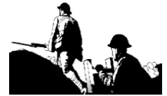
Hostility towards God

T he teaching of the New Testament is clear – sin angers a holy God, so that man is now God’s enemy. But Jesus died in the place of believers in order to reconcile them to God. 5 They are no longer God’s enemy because their sin has been punished in Christ and removed.