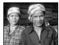
Heaven is multi-racial

B elievers from every land will be in Heaven. The New Testament describes Heaven as a holy place where God and His angels live. Nothing impure or sinful can ever enter it. 7 Believers are reconciled to God through Christ’s death, and their sin has been taken away. Now there is nothing to prevent them entering Heaven when they die.