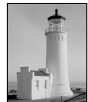
Jesus was a great light

God never made people hate Jesus, but He used the hate that was in man to bring about His purposes. The perfect life of Jesus made the imperfections of others more obvious. So they hated Jesus, and preferred to kill Him rather than have their own sinful ways exposed by His light. Jesus was a light in a dark world. Men tried to extinguish the light, preferring the darkness of their sin. Look up John 3:19